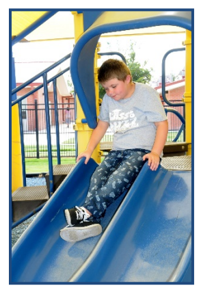
Ivory on the slide.