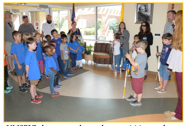
NMSBVI elementary class welcomes visiting students from the Las Cruces Academy.