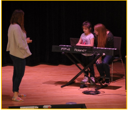
Rehearsals have begun for the Talent Show!